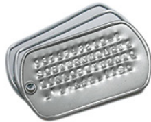
Debossing Type Set Elite Dog Tag