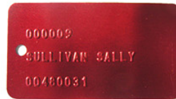
Medical Alert Tag