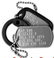
Embossing Type Set Simplex 2